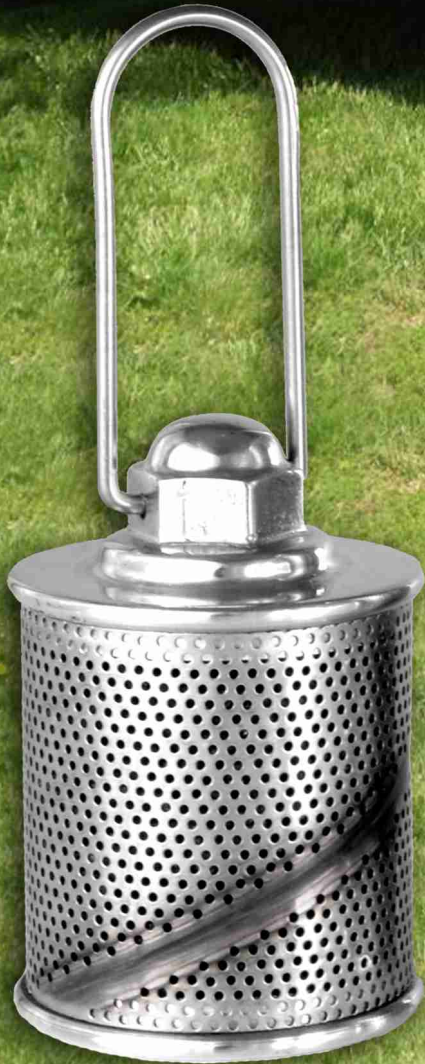
SD 303AH SERIES